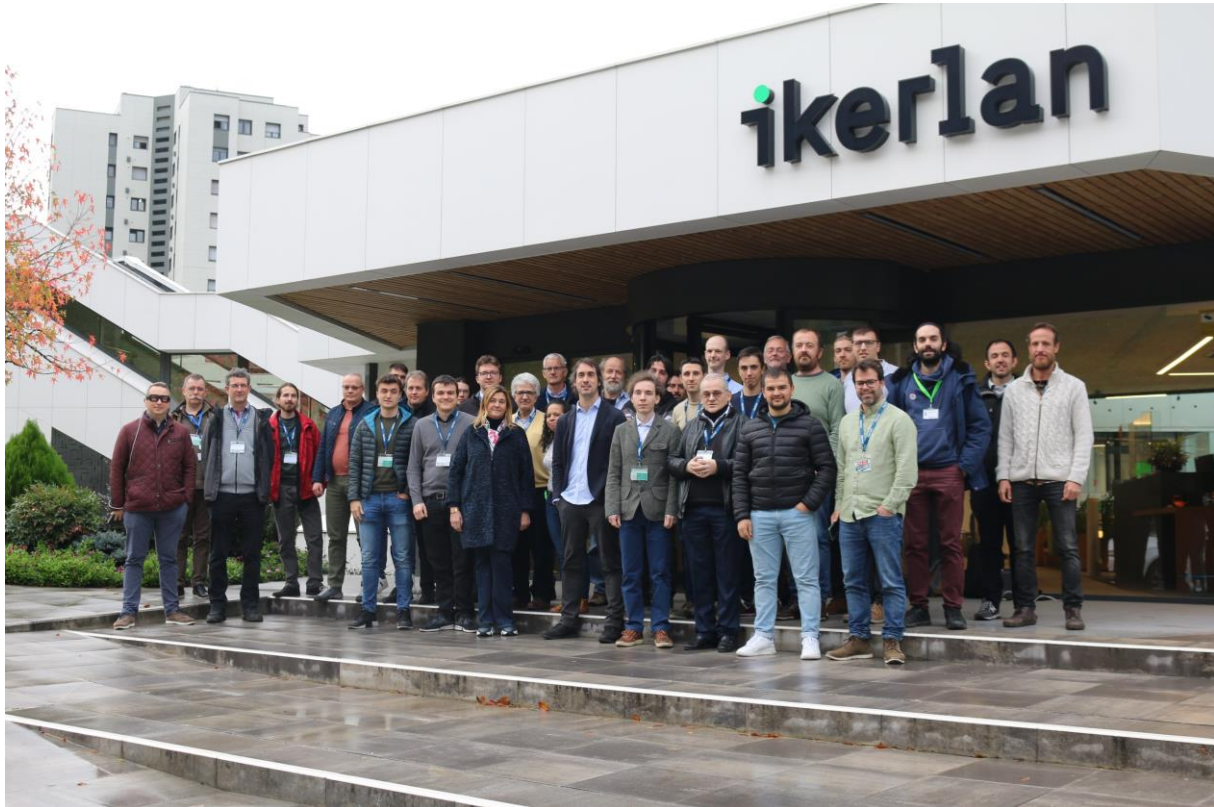
The NimbleAI team perceived in event-based vision